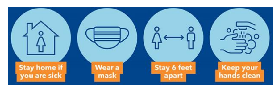
Help Protect yourself and others from COVID-19 and other Infections

We ask that this information is shared with family members and visitors in advance of any visit, and that the guidance is followed to protect the health and safety of our patients and visitors.